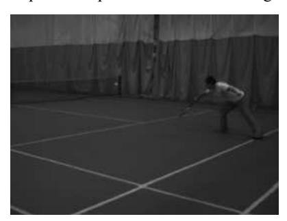
Figure 2: A sample frame from video taken on an indoor tennis court.

monochrome camera at a resolution of 782 \times 582 pixels at 25 fps. A sample frame is shown in Figure 2.