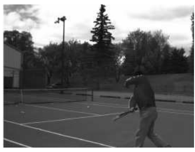
Figure 3: A frame from the outdoor tennis court. Notice the trees and clouds visible in the background.

To determine whether this was the case, we recorded another thirty videos in an outdoor environment. The weather on the day we did the recording was extremely active, with trees in the background swaying vigorously and clouds moving rapidly. The cloud movement caused issues for two reasons: first, the clouds were sometimes visible as moving objects in the scene; second, the clouds sometimes moved in front of the sun or out from in front of it, causing rapid changes in illumination. This highly dynamic background provides a good test case for automatic tennis ball tracking, since real tennis match videos are unlikely to have worse conditions. A sample frame from the outdoor setting is shown in Figure 3.