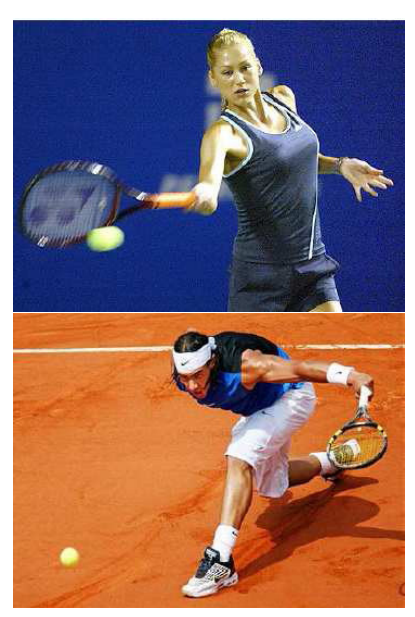
Figure 4: Sample frames from the Wimbledon video. In these frames, the ball is clearly visible.

achieve recognition rates higher than 90%. This is because they use additional cues to track the tennis ball. They use trajectory information to predict the path of the ball; this is likely the most important source of information not used by our methods. Also, human viewers can obtain secondary cues about the position of the ball based on the reactions of the professional tennis players, who are able to track the ball extremely well. It is unlikely that such information will be used by computer vision systems in the near future. Cues of this type often enabled us to locate the ball in the frames we labeled "poor visibility", such as the first image in Figure 5, but it is not feasible even for the human eye to locate the ball with high confidence from the single frame alone, despite all the context information and object recognition ability that humans bring to the problem. We should comment also that color information enhances the ball visibility in the second image in Figure 5, but color information was not available to our algorithms, owing to our use of a high-speed monochrome camera.